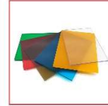
Polycarbonate & Acrylic