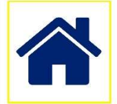
OEM & ODM